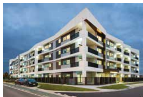
- NEWTON APARTMENTS

We hope that all of the new residents are settling in well and we welcome them to the community.