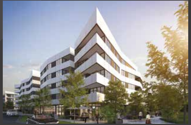
- ARTIST IMPRESSION / OXFORD APARTMENTS

Construction has recently begun on stage one of the Oxford Apartments with completion due by mid-2018. We look forward to seeing the building take shape over the coming months!