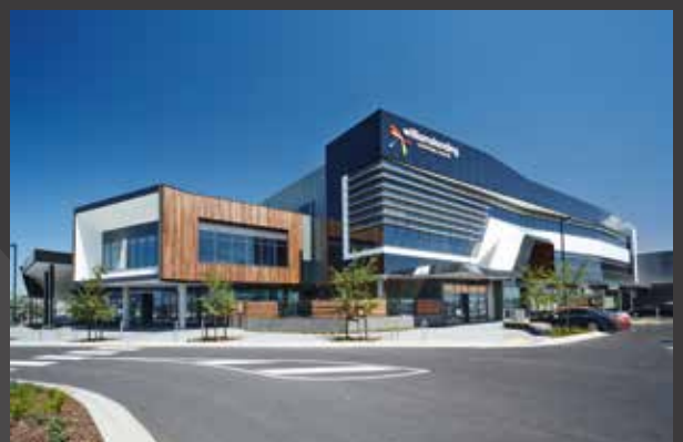
- WILLIAMS LANDING SHOPPING CENTRE

We will be located in the shopping centre until our new office is ready, which will be located next to the Williams Landing Shopping Centre. We are expecting to move to this location in the coming months. If you have any enquiries or want to speak with a sales representative about opportunities within the community, please contact 1300 11 22 02.