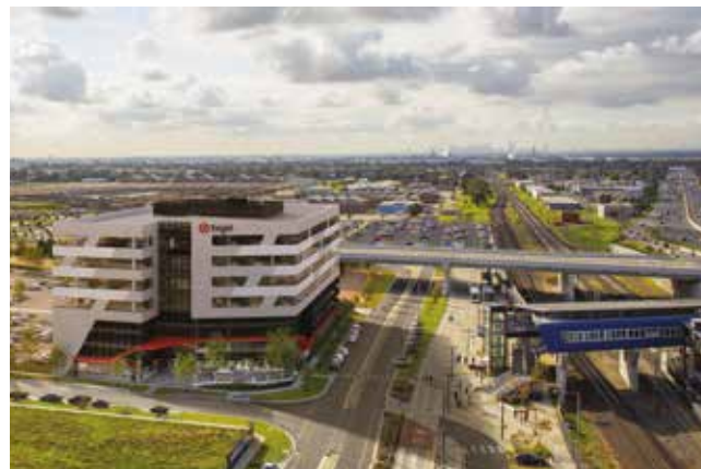
- ARTIST IMPRESSION / TARGET AUSTRALIA HQ

We look forward to welcoming Target employees to Williams Landing in 2018!