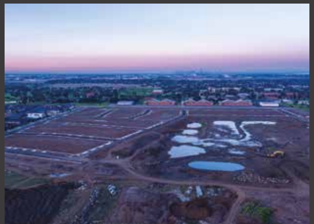
- AERIAL VIEW / ADDISON NEIGHBOURHOOD

We have also recently released Addison stage 5A which sold out within just one week. Due to strong demand, we will be selling the next release in the coming weeks. If you are interested in purchasing in the Addison neighbourhood, please contact our sales team on 1300 11 22 02 or visit our sales suite.