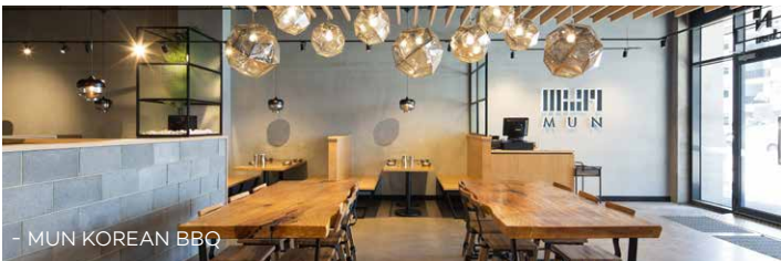
- MUN KOREAN BBQ

To get in touch with Red23, please call 03 8372 2122, email info@red23realestate.com.au or visit them at Shop 25A in the Williams Landing Shopping Centre.