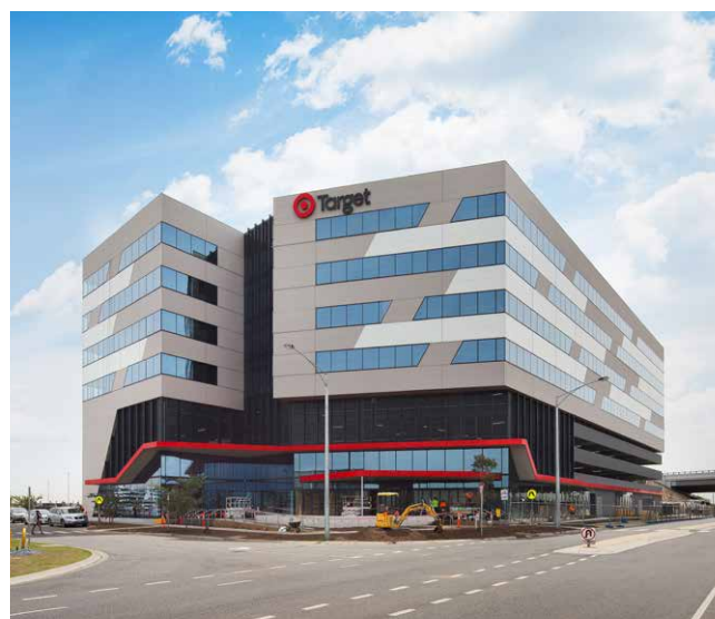
- TARGET HEADQUARTERS

Target's move to Williams Landing represents a major coup for economic growth in the community, which has been designated as a Priority Development Area by the Victorian Government. It will support job creation, benefit existing local businesses and attract other leading companies to the area.