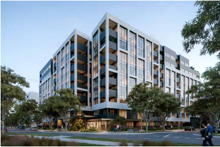
- ARTIST IMPRESSION / LINCOLN APARTMENTS