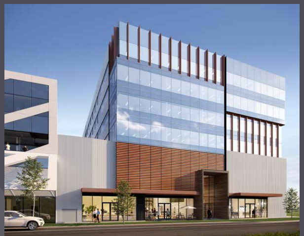
- ARTIST IMPRESSION / 101 OVERTON ROAD

Located in the heart of the Town Centre, the offices are located directly opposite the Williams Landing Shopping Centre and only a short walk to the train station and bus terminal. To enquire call 1300 11 22 02, visit www.williamslanding.com.au or visit our friendly sales consultants Carol and Jeremy at 100 Overton Road, Williams Landing.